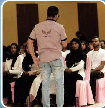
Personal Development & Training